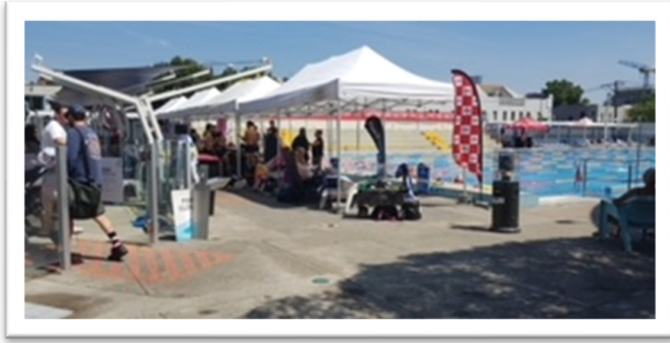
A scene from the recent Megaswim at the Fitzroy Pool.