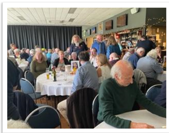
The crowd at the lunch.